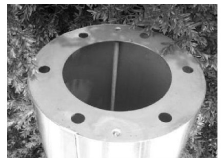
TOP VIEW. Fig 3.