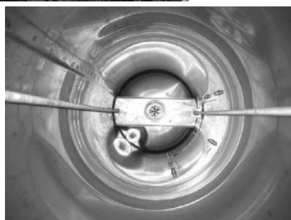
INTERNAL VIEW. Fig 2.